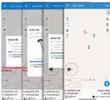
IMU Tilt Survey