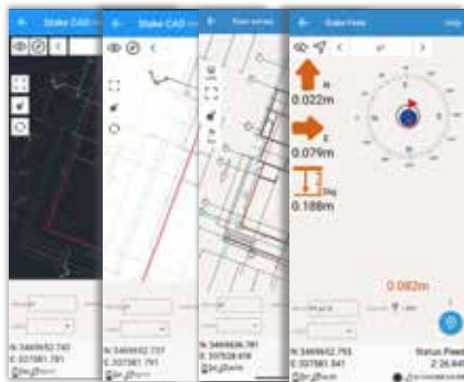
CAD Basemap and Stake